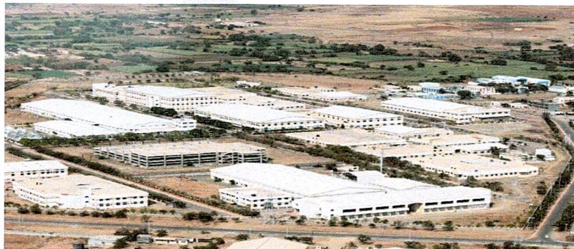
Baramati Hi-tech Textile Park Ltd