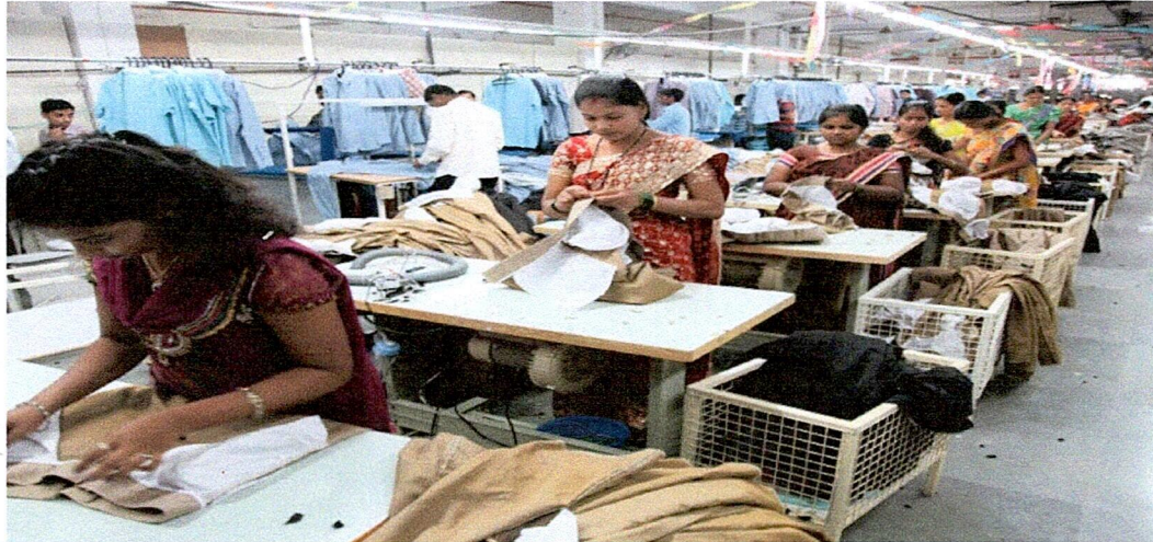
Stitching Area @ Cotton King Pvt. Ltd