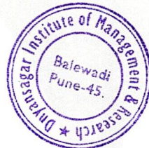
Director Dnyansagar Institute of Management and Research Balewadi, Pune-411045