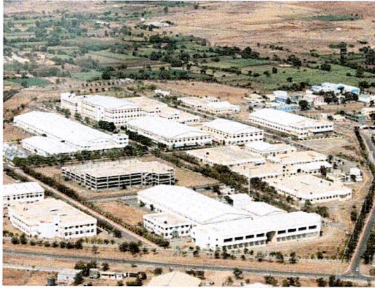
Baramati Hi-tech Textile Park Ltd