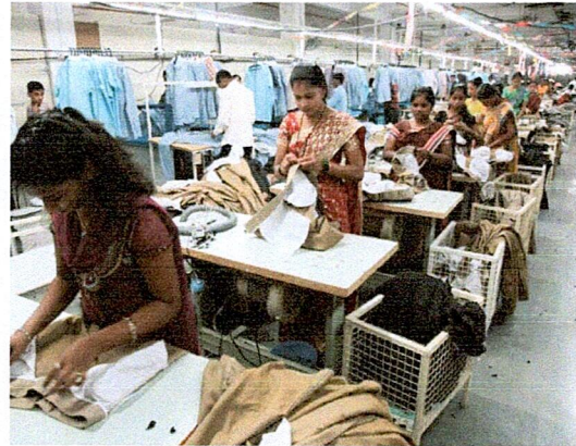
Stitching Area @ Cotton King Pvt. Ltd